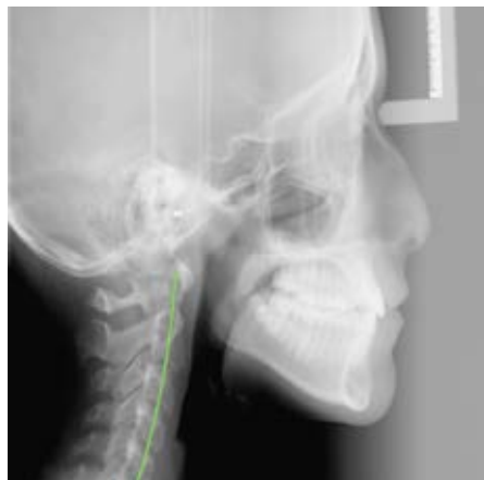
November 2020 - Post treatment

Malocclusion is characterised by contraction of the upper jaw with reduced space for the eruption of permanent teeth. The therapy sequence involves the following steps: