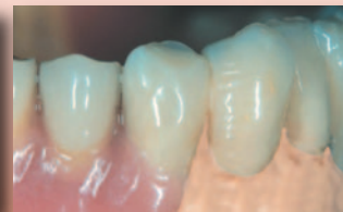
Combinated prostheses in Tender composite and resin