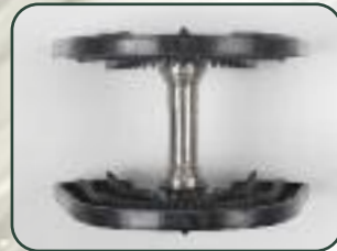
Aligner for double impression