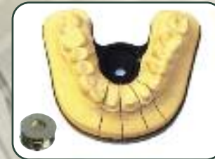
Magnet for articulating