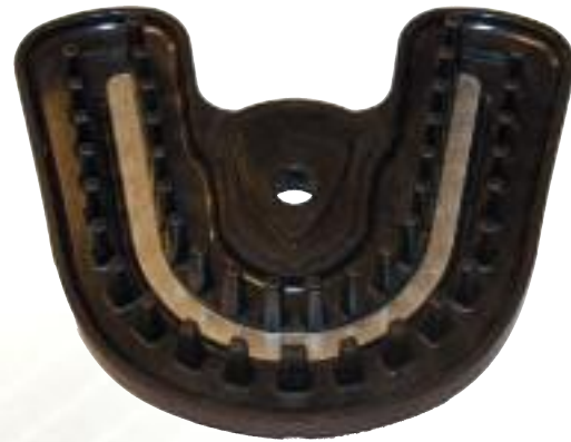
Tender Tray 1 with pin retentions and metal support for "magnetic" dies

Tender Flask In Press is an innovative flask with different covers that can hold the Tender Tray "Magnetic", and it can be used with both injection and pressure technique.