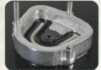
Tender Tray usable in flask