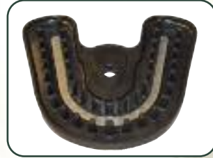
Tender Tray 1