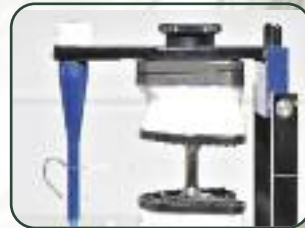
Trays on articulator using magnets