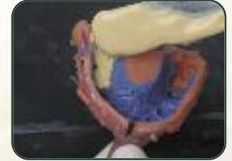
Model casting in the impression