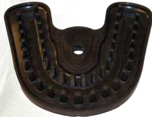
Tender Tray 2 with pin retentions totally made of plastic