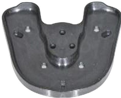
Tender Tray 4 flat without retentions for split cast