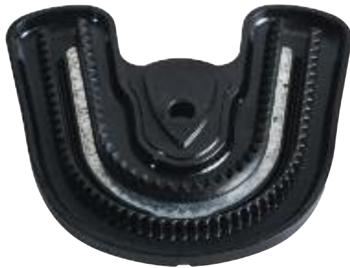
Tender Tray 3 with knurled retentions and metal support for "magnetic" dies on implants