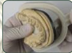
Model removal from rubber box