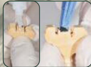
Magnet glued on the dies