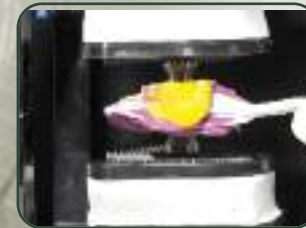
Positioning of double impression