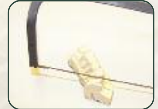
Cutting and finishing