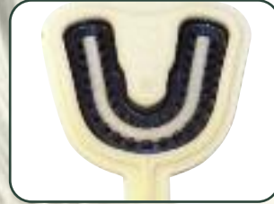
Rubber box and flap for model casting