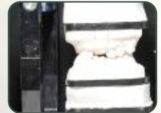
Models on articulator