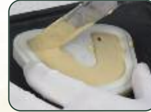
Model casting in Tender Tray